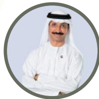
Sultan Bin Sulayem Group Chairman & CEO DP World