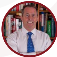
Dr. Liam Fox