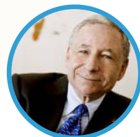
Jean Todt President Fédération Internationale de l'Automobile