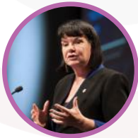
Sharan Burrow General Secretary International Trade Union